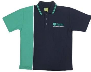
Short Sleeve Polo Shirt