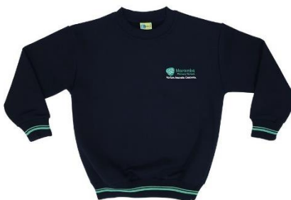
Girls and Boys Windcheater