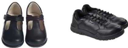
School Shoes These must be completely black.