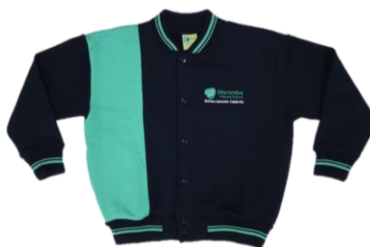
Girls and Boys Bomber Jacket