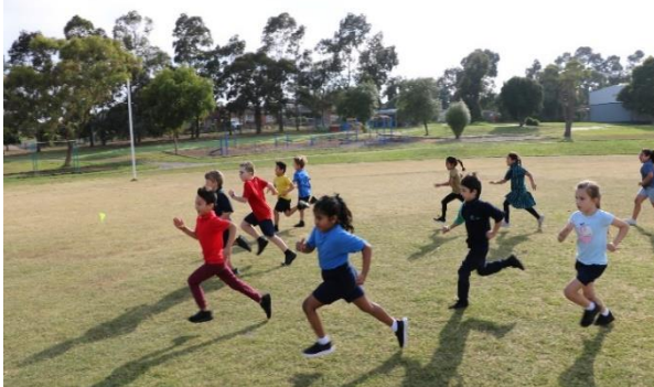
Synthetic Grass Soccer Pitch