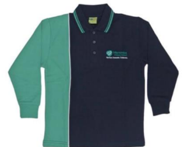
Girls and Boys Short / Long Sleeve Polo